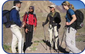
6/2/05 Day 308 Aconcagua Mile 31531