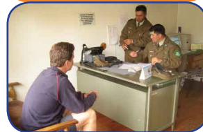
15/2/05 Day 317 Horcon Mile 31622