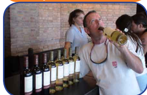
22/2/05 Day 324 Tunuyan Mile 32052