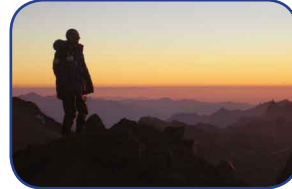
10/2/05 Day 312 Aconcagua Mile 31531