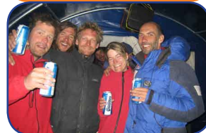
12/2/05 Day 314 Aconcagua Mile 31531