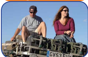
24/2/05 Day 326 Malargue Mile 32360