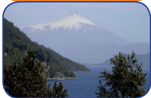
27/2/05 Day 329 Laguna Colica Mile 32822