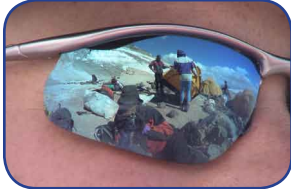
3/2/05 Day 305 Penitentes Mile 31531