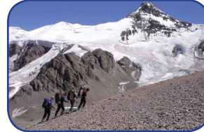
8/2/05 Day 310 Aconcagua Mile 31531