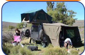
26/2/05 Day 328 Paso Pino Hurchado Mile 32709