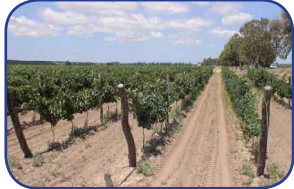
1/2/05 Day 303 Mendoza Mile 31350